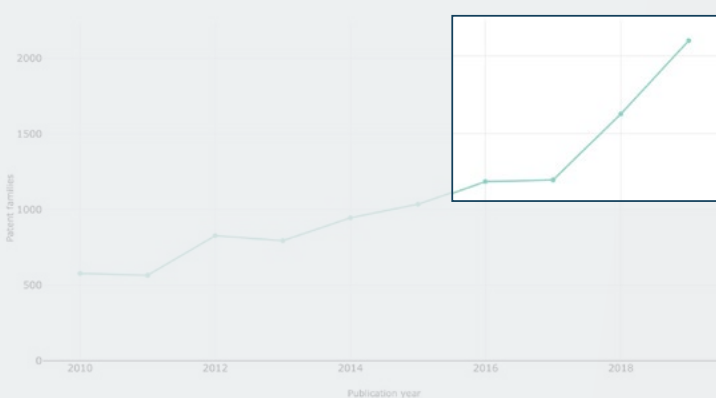
Top 10: Non-Volatile Memory Technology - Active patents in China.

A surge in Chinese patenting since 2017 with numbers up almost 100% in 2019.