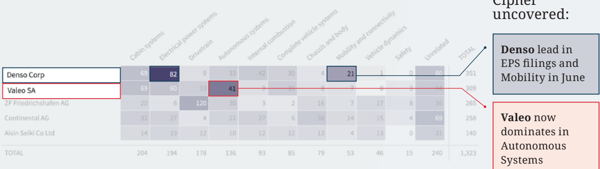
June 2020 Published Patents - showing monitored technologies and unknowns.

In this Automotive example, Cipher discovered that 82% of the 1,323 patents published in June related to ten technology areas mapped onto an example company technology lens.