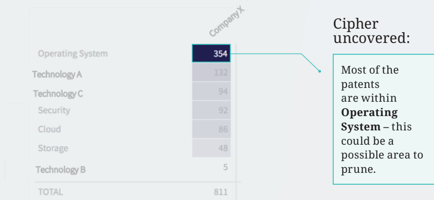
Example Company's Patents with 2020 costs - number of active patent families.

In this Cloud Technology example, a sample organisation who faced a budget challenge, reviewed their portfolio in Cipher focusing on cost and quality scores.