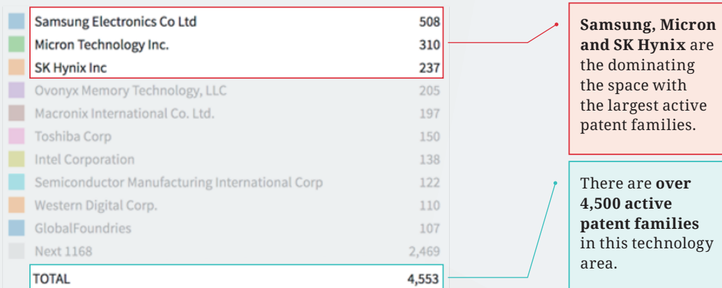
Top 10 players for Phase Change Memory Technology - Active Patent Families.

Given the players involved, the following analysis powered by Cipher enabled them to suggest an acquisition strategy to the business.